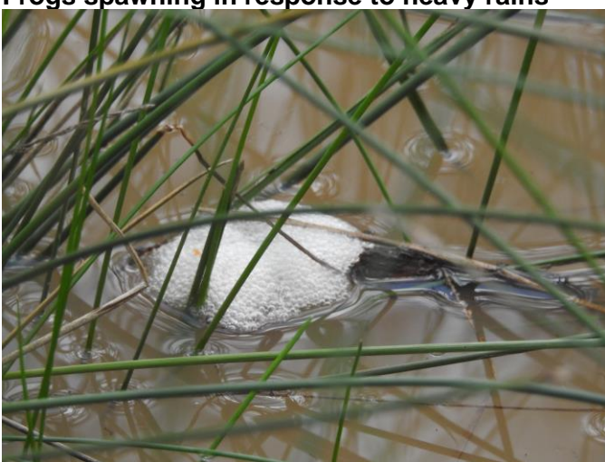
Frogspawn in Melton Gilgai Woodland

Frogs spawning in response to heavy rains