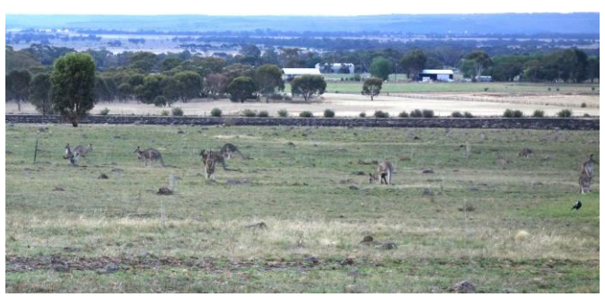
Kangaroos in Mulla Mulla Grassland

About 60 Kangaroos were seen grazing in the patch of grassland recently burnt in October. The Kangaroos were quick to take advantage of the green pick that grew after the burn.