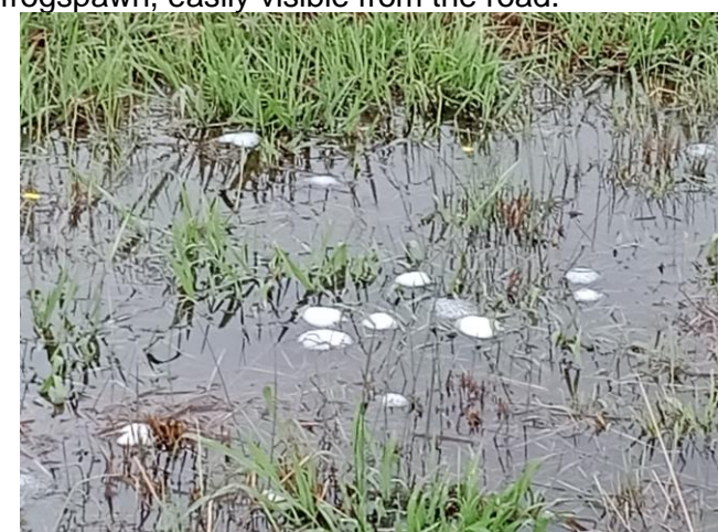
Frogspawn in roadside puddle Toolern Vale

The massive rainfall event over Christmas triggered an equally massive frog spawning event in & around Melton. Melton Gilgai Woodland, in Harkness Road, was loud with the calls of Spotted Marsh Frogs, accompanied by one lone Pobblebonk. Although most gilgai depressions were filled with water the frogs were only spawning in the single deep pool beside the road. Perhaps the smaller, shallower depressions may not hold water long enough to allow tadpoles to grow to adulthood. The larger waterholes that form the upper reaches or Arnolds Creek between the woodland & the cemetery are no doubt also the scene of this same massive spawning event. The pool only fills with water a few times per decade or so, after heavy downpours. Other nearby dams & roadside puddles had similarly large numbers of frogspawn, easily visible from the road.