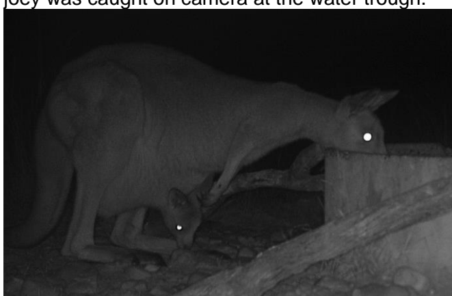
Kangaroo with joey Pinkerton

The water trough at Pinkerton continues to be a focus of wildlife activity. About eight kangaroos have also returned to Pinkerton. This mother with a joey was caught on camera at the water trough.